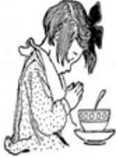
Table Grace of the Month

We thank You for Your goodness, Lord, Your blessings from above. And may the meals that we prepare be seasoned with Your love. Amen.